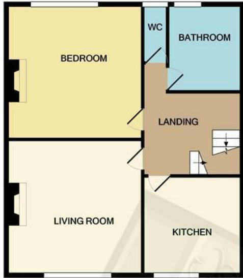
1ST FLOOR APPROX. FLOOR AREA 577 SQ.FT. (53.6 SQ.M.)