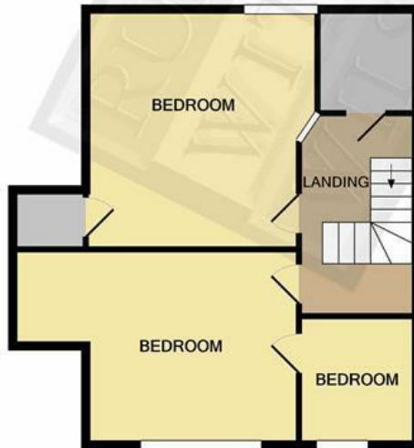
2ND FLOOR APPROX. FLOOR AREA 437 SQ.FT. (40.6 SQ.M.)

TOTAL APPROX. FLOOR AREA 1052 SQ.FT. (97.7 SQ.M.)